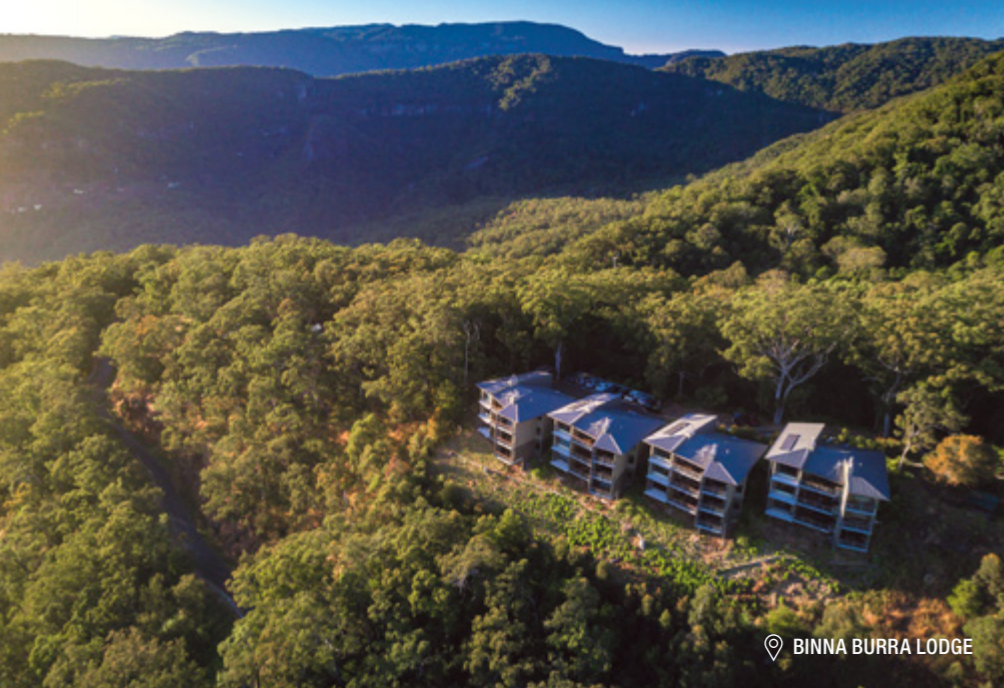
📍 BINNA BURRA LODGE