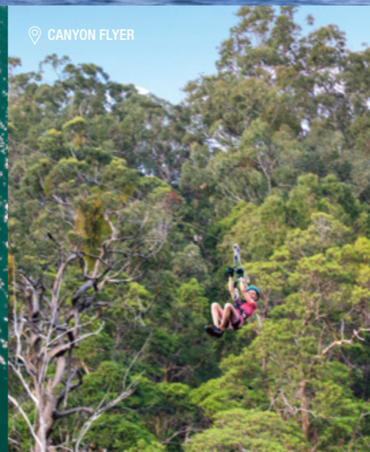
📍 CANYON FLYER