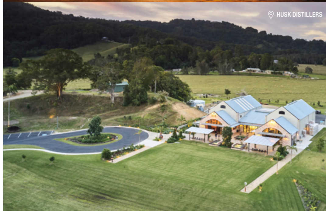
📍 HUSK DISTILLERS