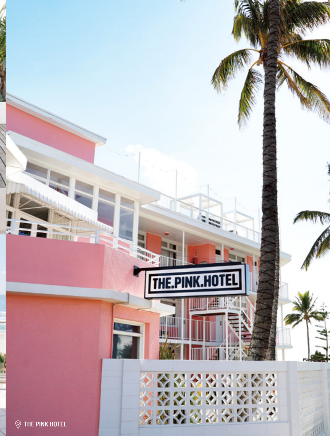
📍 THE PINK HOTEL