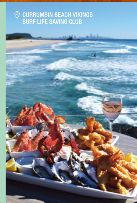
CURRUMBIN BEACH VIKINGS SURF LIFE SAVING CLUB

HORIZON SKY DINING “THE GOLD COAST HAS BECOME A FOODIES PARADISE - HOME TO FINE DINING & RELAXED BEACHSIDE EATS, INCLUDING 20+ AWARD WINNING RESTAURANTS”