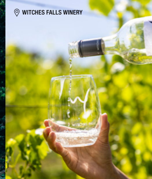
📍 WITCHES FALLS WINERY