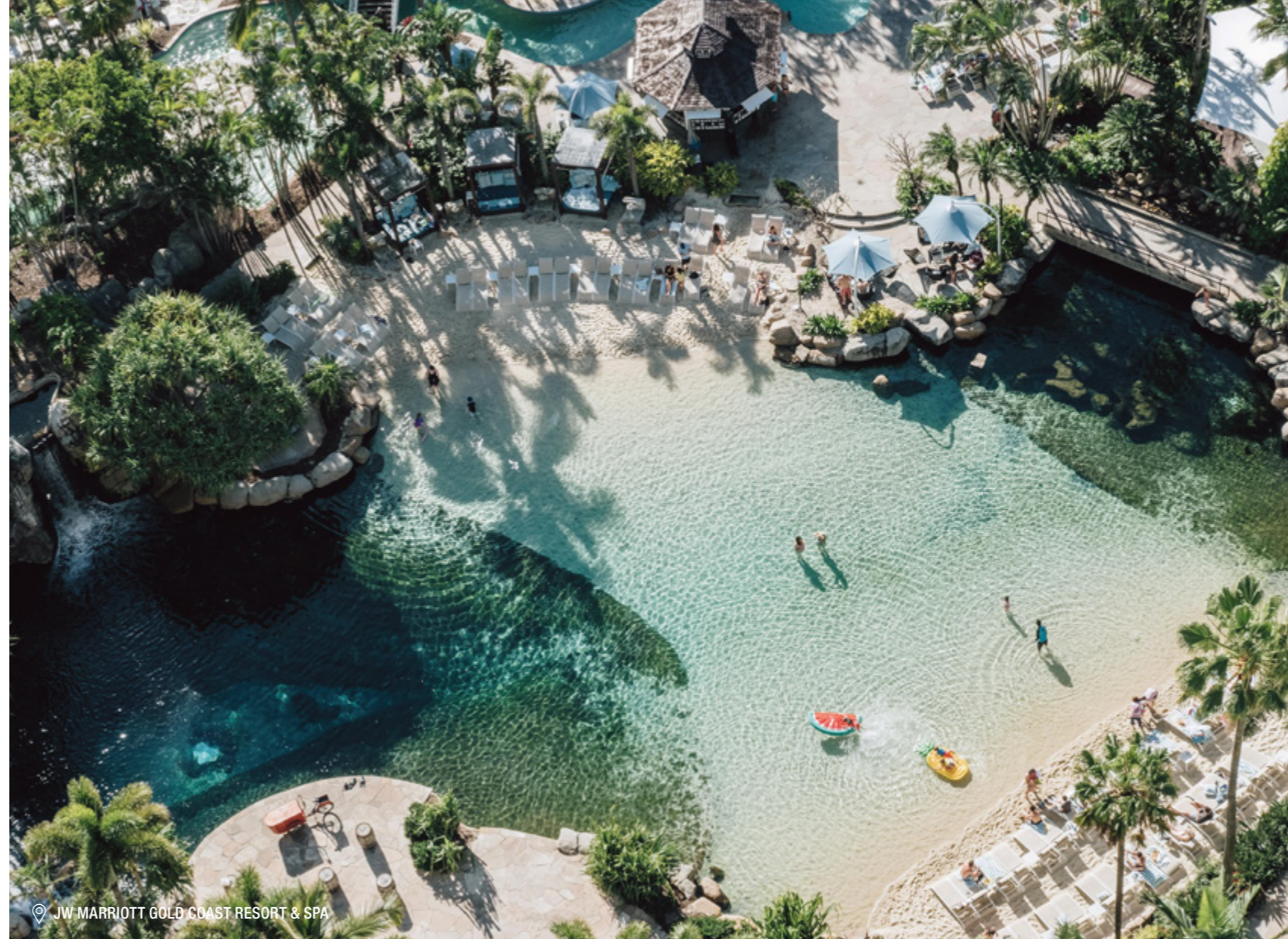
📍 JW MARRIOTT GOLD COAST RESORT & SPA