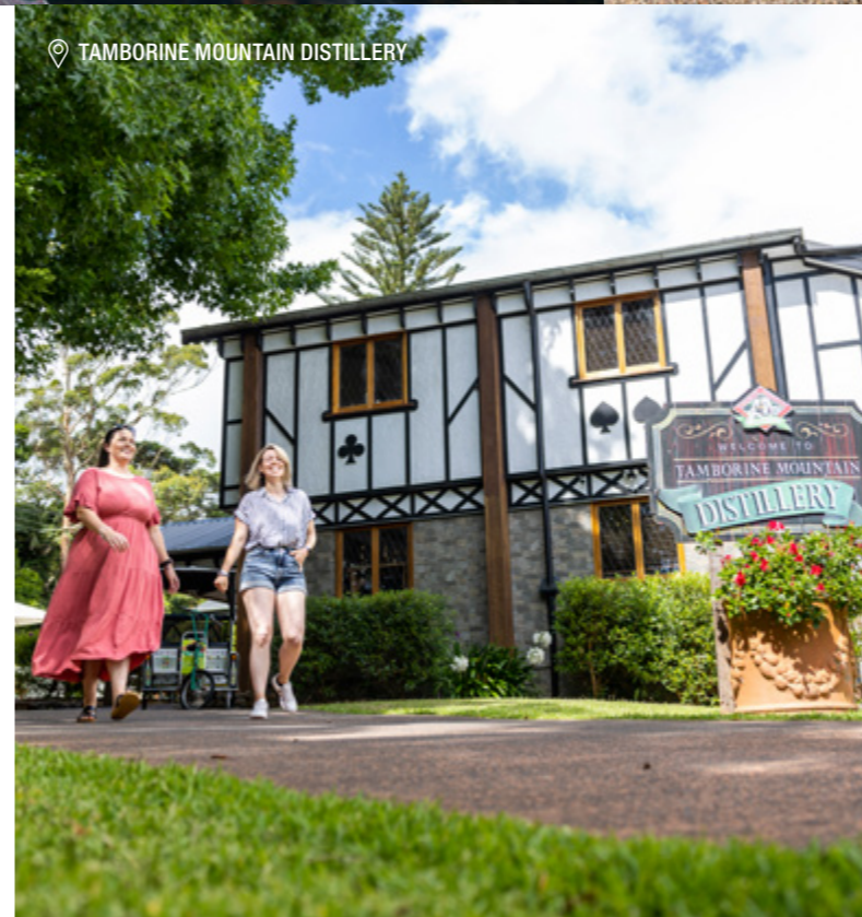
📍 TAMBORINE MOUNTAIN DISTILLERY