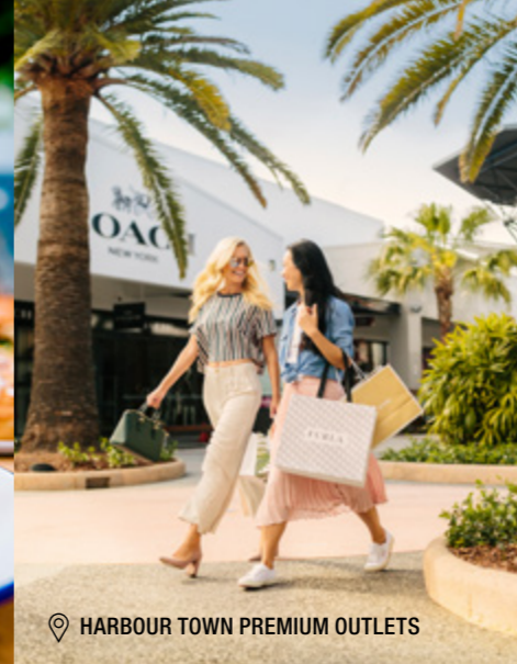
📍 HARBOUR TOWN PREMIUM OUTLETS