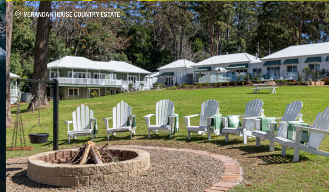
📍 VERANDAH HOUSE COUNTRY ESTATE