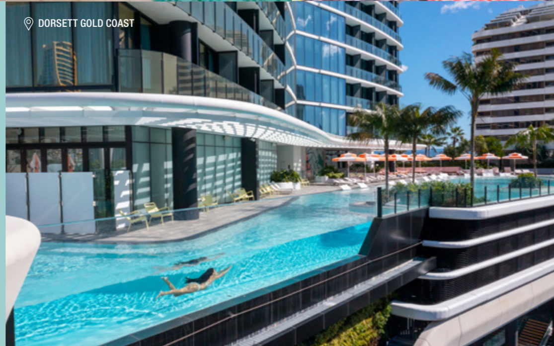
DORSETT GOLD COAST

DID YOU KNOW? THE GOLD COAST HAS AN AVERAGE OF 10 HOURS OF SUNSHINE A DAY FOR APPROXIMATELY 300 DAYS PER YEAR. YOU'RE WELCOME.