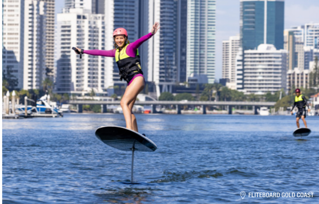
📍 FLITEBOARD GOLD COAST