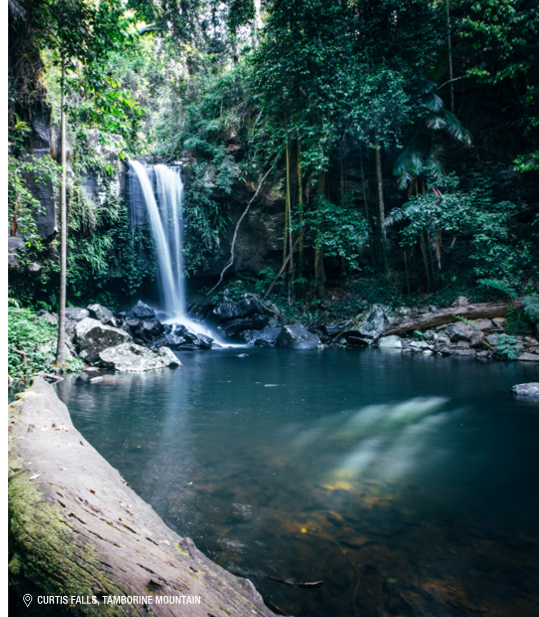
📍 CURTIS FALLS, TAMBORINE MOUNTAIN

Sink into the serenity of a Gold Coast glamping trip at Tamborine Mountain Glades, which offer rustic camping with lots of luxe. Or treat yourself to an overnight stay at Verandah House Estate.