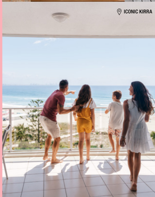
📍 ICONIC KIRRA