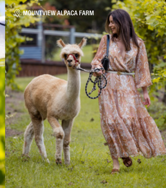
📍 MOUNTVIEW ALPACA FARM