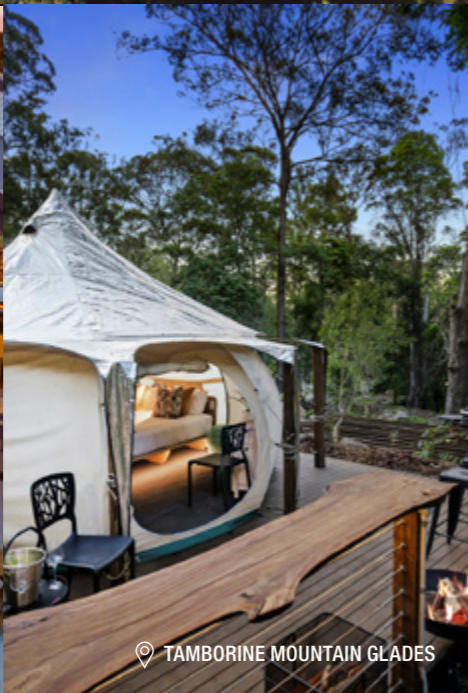
📍 TAMBORINE MOUNTAIN GLADES