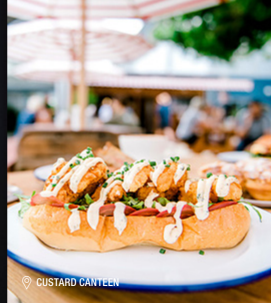
📍 CUSTARD CANTEEN

Your last night with the girls on the Gold Coast is a time for celebration and Pink Flamingo is the place. The stage show is a sexy and sophisticated blend of circus, cabaret and burlesque set in an intoxicating 1920s-style space and you can expect mesmerising aerial angels, world-class dance and vocals and a few daring stunts to top it all off.