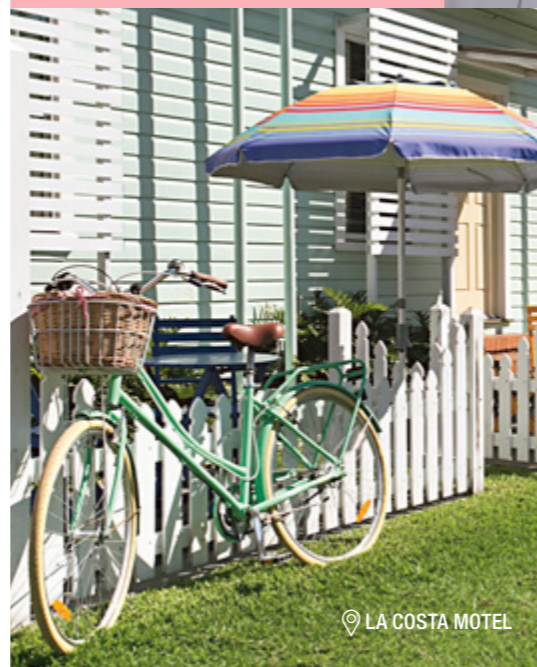
📍 LA COSTA MOTEL