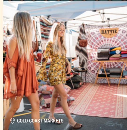
📍 GOLD COAST MARKETS