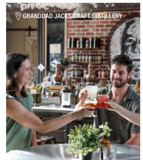
📍 GRANDDAD JACKS CRAFT DISTILLERY