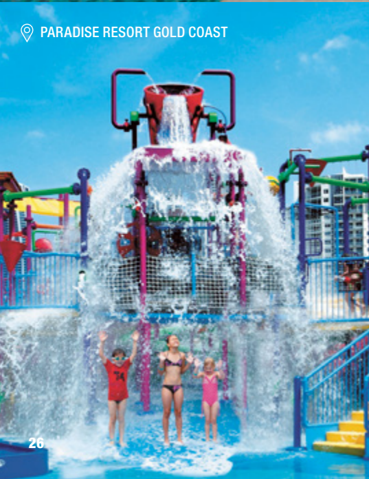
PARADISE RESORT GOLD COAST

DID YOU KNOW? THE GOLD COAST HAS AN AVERAGE OF 10 HOURS OF SUNSHINE A DAY FOR APPROXIMATELY 300 DAYS PER YEAR. YOU'RE WELCOME.