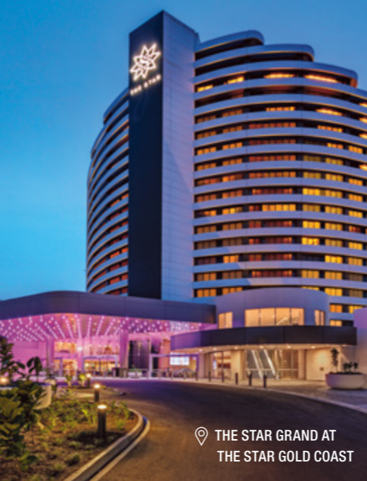
THE STAR GRAND AT THE STAR GOLD COAST