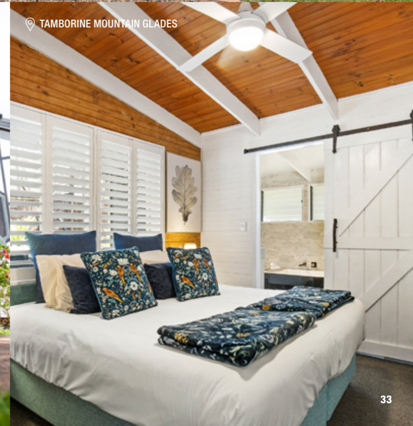
📍 TAMBORINE MOUNTAIN GLADES

For day three of your outdoor, nature-loving inspired road trip, sample a local drop at some Hinterland wineries. Witches Falls Winery is housed in a rustic barn venue with a pretty courtyard, or sample a gin or two at Cauldron Distillery.