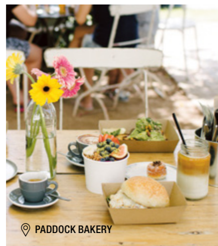
📍 PADDOCK BAKERY