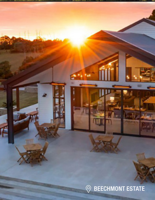
📍 BEECHMONT ESTATE