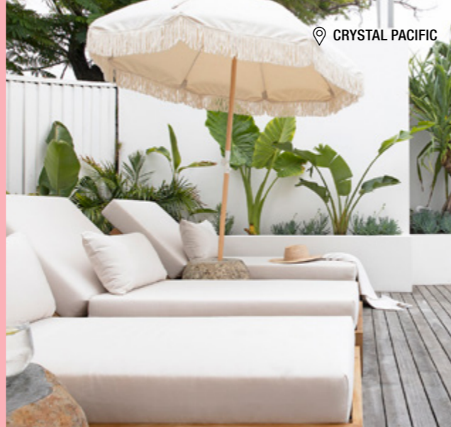
📍 CRYSTAL PACIFIC

This is my backyard. Currumbin Alley has breathtaking views from inside and outside the water and it's a great spot for all levels of surfing skill. Easy to say that this place is pretty special.