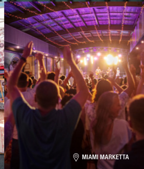
📍 MIAMI MARKETTA