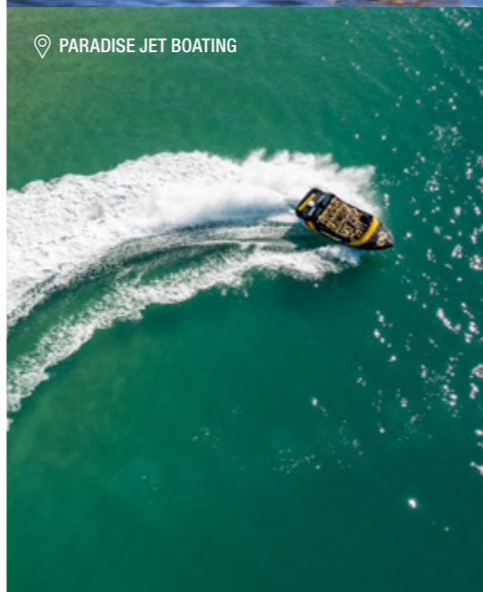
📍 PARADISE JET BOATING