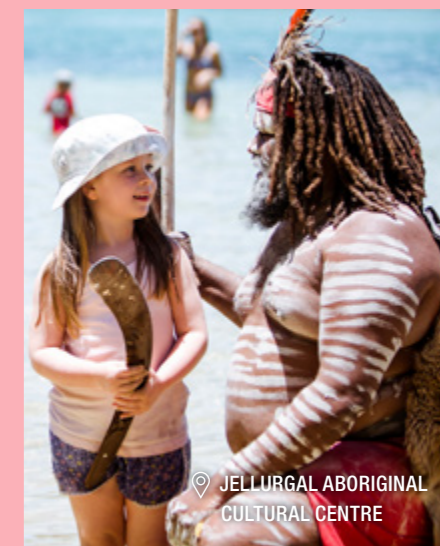
📍 JELLURGAL ABORIGINAL CULTURAL CENTRE

Set throughout Evandale Parklands, the Sculpture Walk features 49 art pieces on a peninsula in the Nerang River. A meandering path takes viewers close to the artworks set in beautiful natural surrounds. It's a little oasis of creativity that provides a peaceful contrast to the bustling Gold Coast heart.