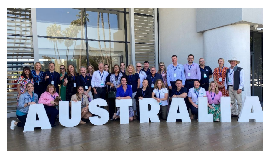
Our recent mission to Korea (Busan & Seoul) and Japan (Osaka & Tokyo) was a whirlwind of activity and resounding success. In just one week, we managed to engage with 20 suppliers, connecting them with over 300 travel agents, media representatives, and aviation partners.